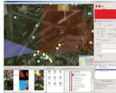
Spider command & control