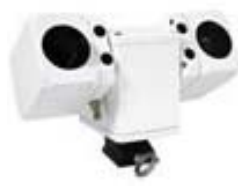
High quality cameras