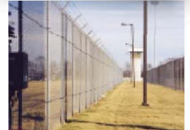
Appropriate perimeter protection