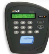
Provision for high security zones